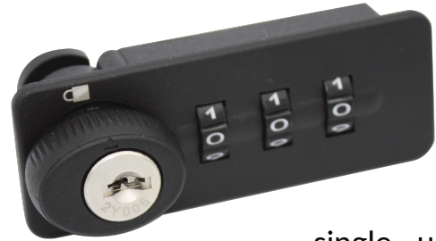
single - user